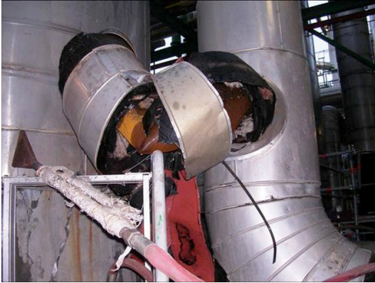
Fig. 2 – photo of the crease in pipe self-sealing the leak