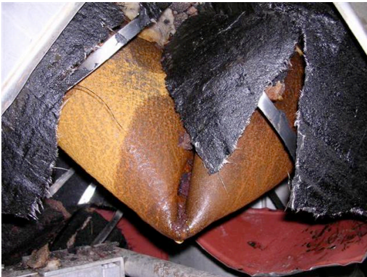
Fig. 2 – photo of the crease in pipe self-sealing the leak